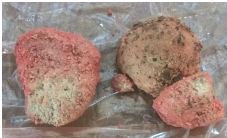
Fig. 1: Urethral calculus recovered from Mare by Manual Lithotripsy

sensing a lack of resistance in the syringe plunger during solution infusion. In the hanging drop technique where, after the needle is through the skin and subcutaneous tissue, a drop of saline can be placed in the hub of the needle. When the needle enters the epidural space, negative pressure will cause the drop to be aspirated. Four ml of 2% lignocaine Hcl was administered at the above specified place. The effect of epidural anaesthesia was assured by flaccidity of tail. Due to large size of the calculus it was difficult to retract it through the urethra. After epidural anaesthesia with the help of index finger and middle finger the calculus was grasped and then it was broken into 3 pieces by crushing with sterile stainless steel artery forceps and removed with least possible injuries to the urethra and surrounding tissues. Then, the urethra was flushed with 200ml Metrogyl (Metronidazole, J.B. Chemicals & Pharmaceutical Ltd) thrice using sterile IV set and finally douched in 100 ml Metrogyl added with 10 ml povidone iodine solution.